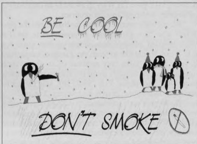
Figure 2. Some of the winning posters from the 1990 Tar Wars Poster Contest were made into postcards by the Coalition for a Tobacco-Free Colorado.

During the 1991-92 school term, Tar Wars will be offered to students in eight states in the western United States by the Rocky Mountain Tobacco-Free Challenge.